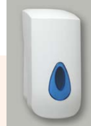
Modular Dispenser Order code: D080AEV