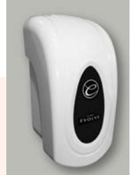
Evolve Dispenser Order code: D011AEV Request a Citrand gel pump fitting.