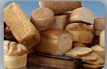
Bakery / Dry Food Processing